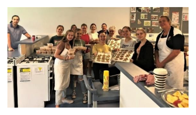
McAuley Catholic College Hospitality students prepping Christmas meals for those in need.

make sure everyone has access to food over the holidays.