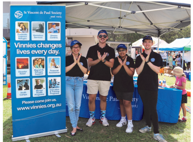
Members of Vinnies young adult conferences