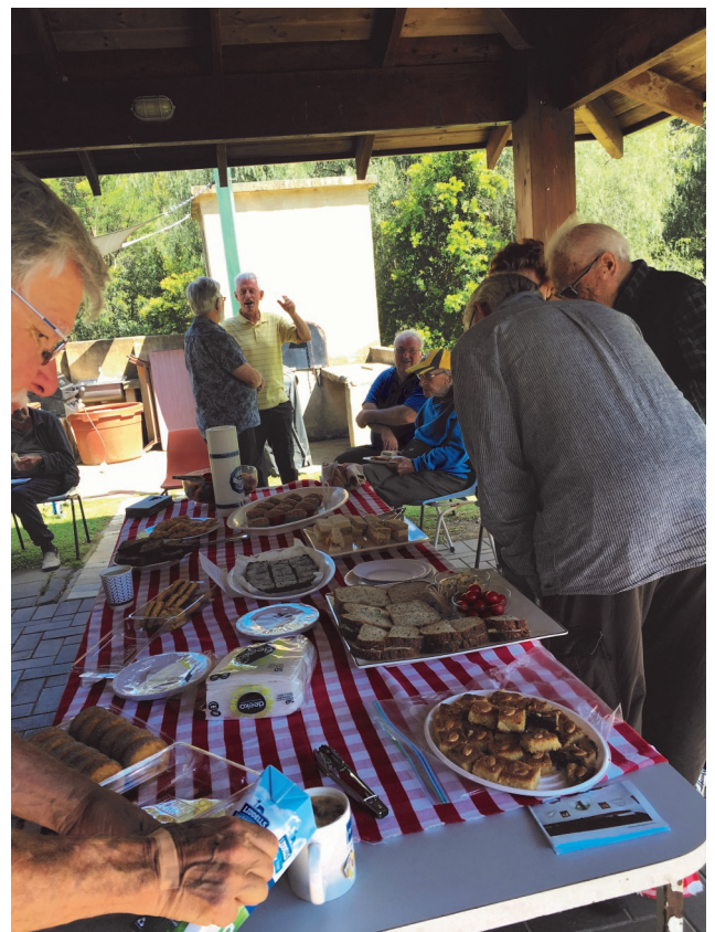
Members, friends and staff gather for a reception after Mass