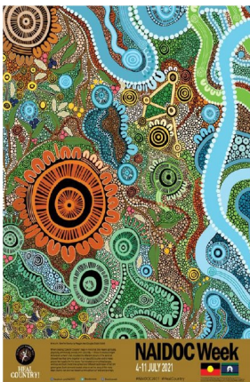
Yamma Maliyaa Hello in Cammeraygal

By working with our Indigenous sisters and brothers to Heal Country , we share in the dignity of the First Peoples of this land and strengthen the solidarity of our national community.