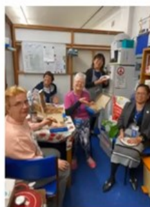
Sweet and savoury treats at Rockdale all week for our volles – great menu