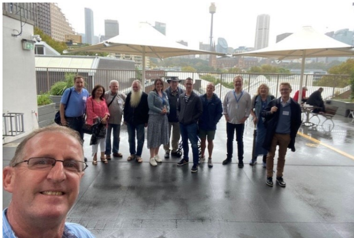
First Mass, tour and Q&A on Sunday 14 March, 2021