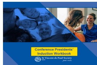
New Conference President's Induction and Mentoring Resource