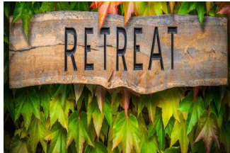
State Council Retreat 2023