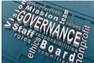
Join our Board Committees!