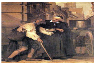
Spiritual Advisers: An essential role in the Society