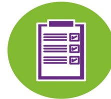
Rental Assistance: An Information Guide